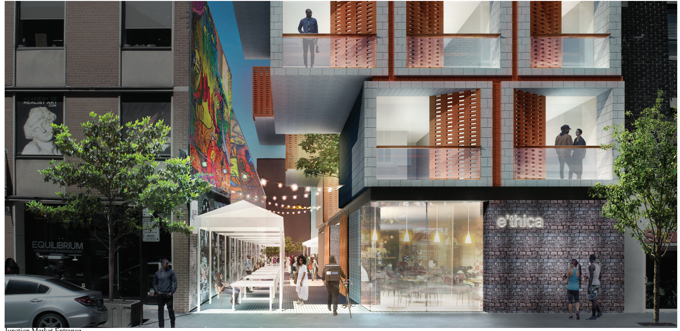
Junction Market Entrance