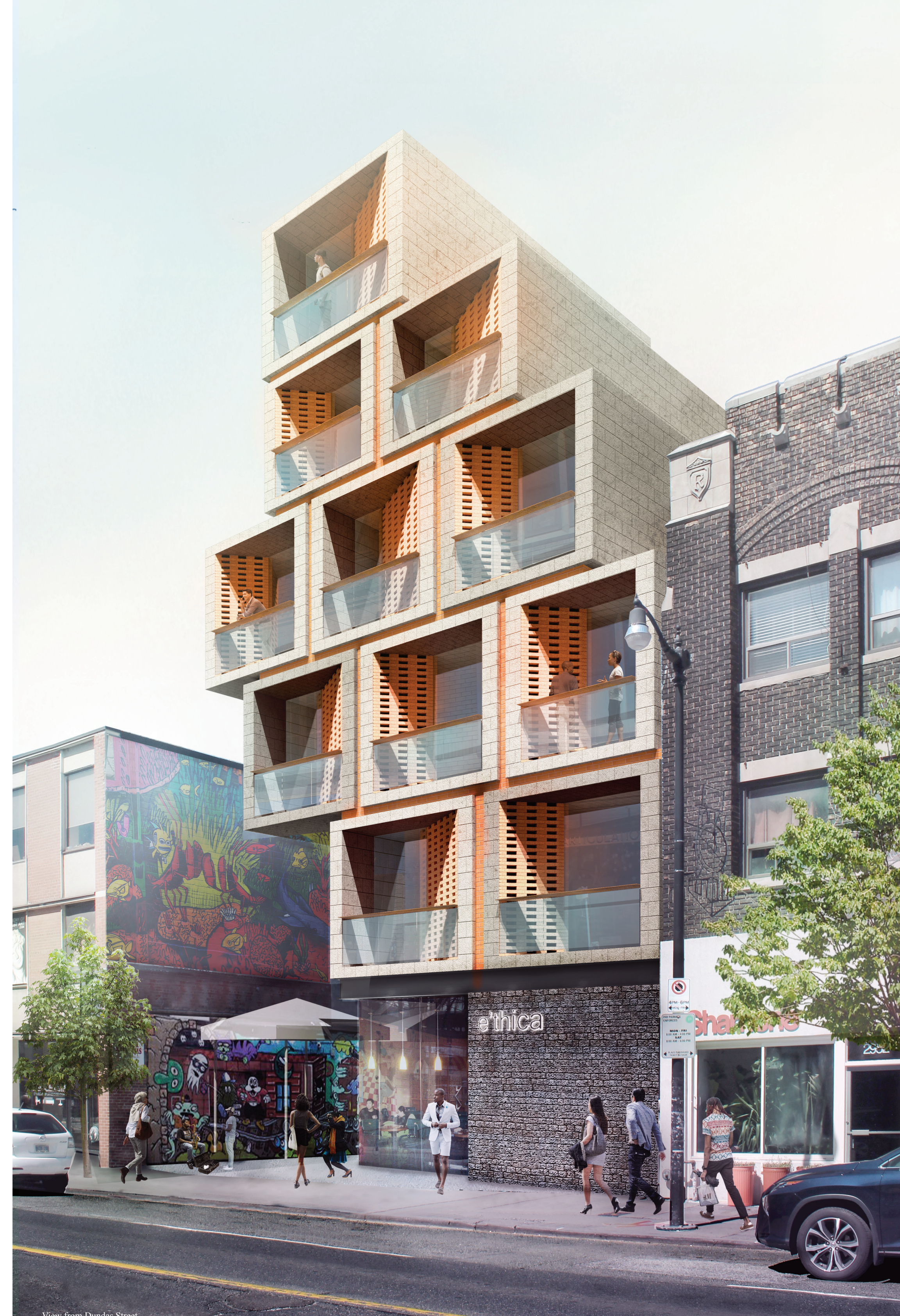
View from Dundas Street